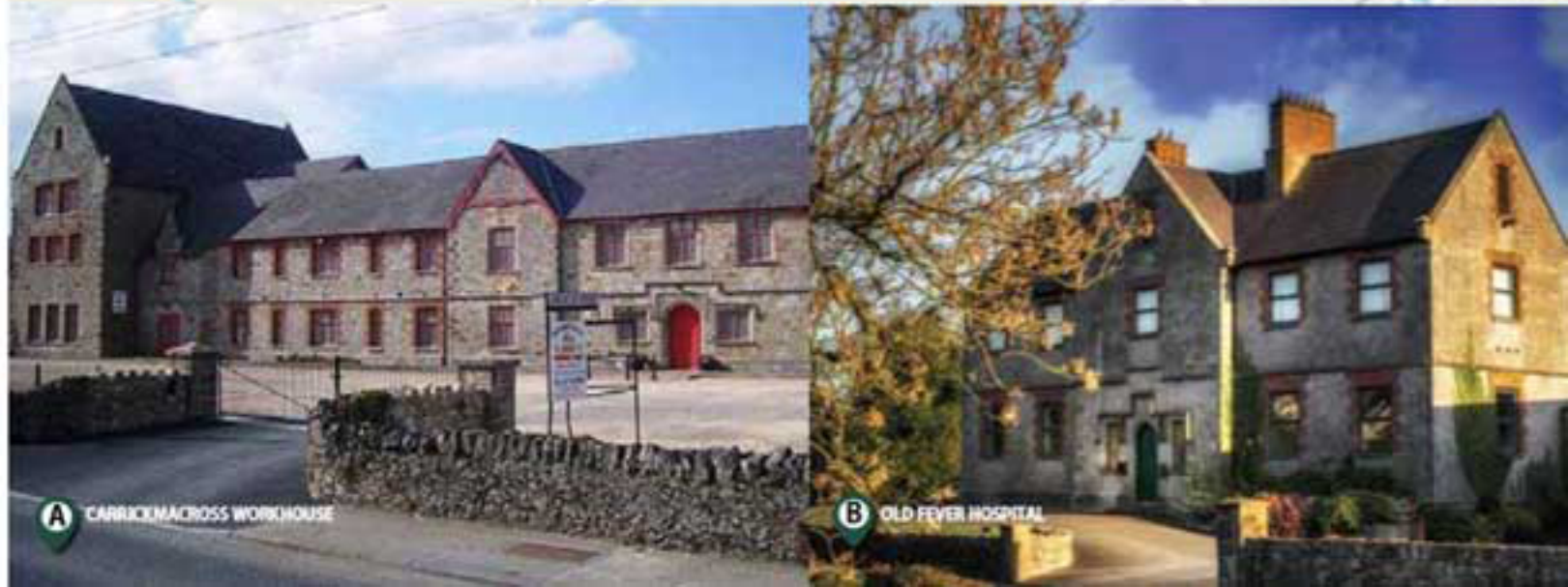
A CARRICKMACROSS WORKHOUSE